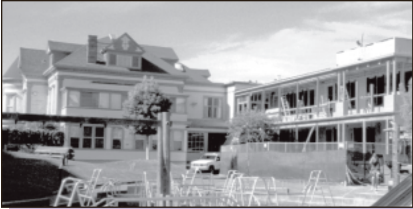
As our grand Victorian stands watch, the Day Home's new wing nears completion. An Open House and Dedication is slated for June 2.