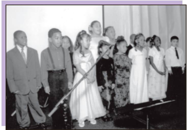
As always, our Saint Vincent's children were the highlight of the evening.