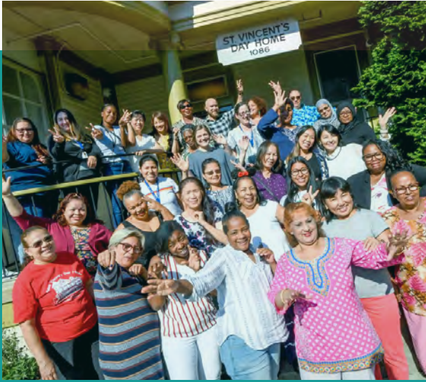
2019-2020 SVDH Staff